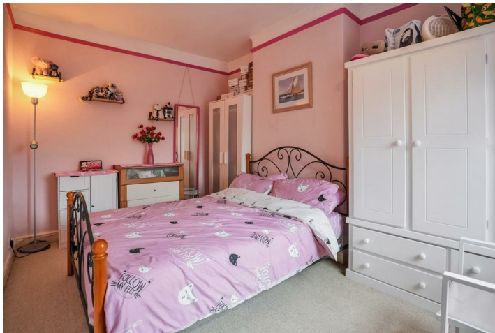
Double glazed window and a central heating radiator. that leads into;